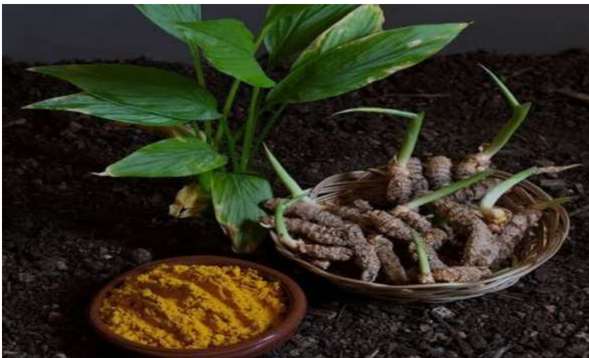
Figure- Turmeric rhizomes