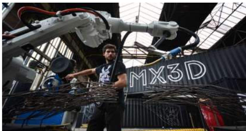
Fig 5 MX3D are one of a number of innovative start-ups in the 3D printed house sector.

Dutch company MX3D have developed a sole building technique called WAAM (Wire Arc Additive Manufacturing), which allows you to 3D print metal structures with a 6-axis robot that beads 2 kilos of material per hour. This robot was the result of association with Air Liquide and ArcelorMittal and is armed with a welder and a nozzle to weld, layer-by-layer, metal rods. This process is additionally compatible with other metal alloys like chrome steel, bronze, aluminium and Inconel. The machine can be associated to a sort of giant soldering iron.