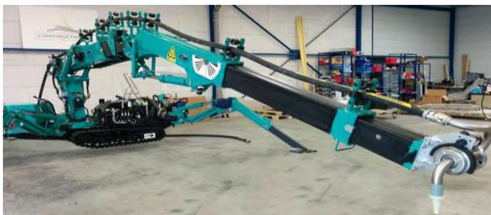
Fig 4 Robotic Arm Extruder

Though not a usually used printing procedure, this FDM printing method has started to see an upsurge in use. This is since the procedure is not fixed to a printing plate, creating it much more mobile. Thanks to the flexibility when aligning the FDM 3D printer head, it is easier to make compound structures. Fig 4