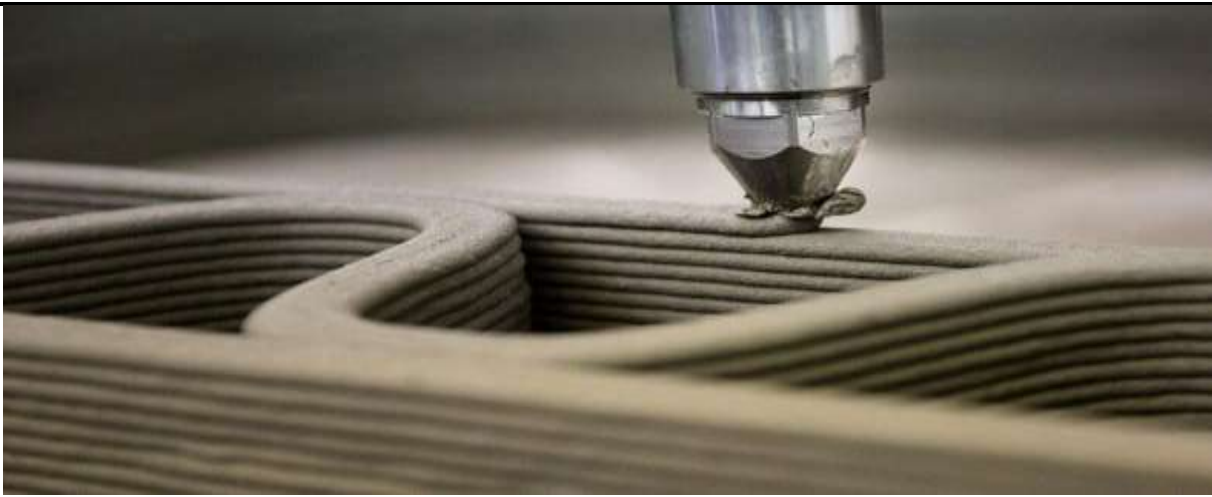
Fig1 architecture and 3D printing