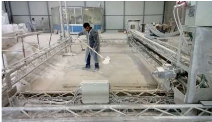
Fig 5 The print site where the D-Shape will 3D print a concrete structure.

Enrico Dini initially created waves as the 'man who 3D prints houses.' He demonstrated an interesting 3D printing procedure by means of his 'D-Shape' 3D printer. This mechanism depends on the binding of powder which makes it likely to harden a layer of material with a binder. Layers of sand are placed according to the wanted thickness before a print head pours dewes to harden the sand. Fig 5