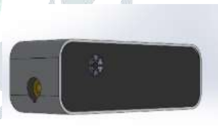
Fig. 5.2 Front View