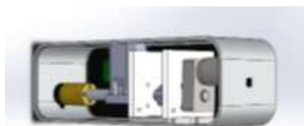
Fig. 5.3 Inclined View Back Side