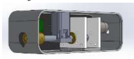
Fig. 1.4 Inclined View Front Side