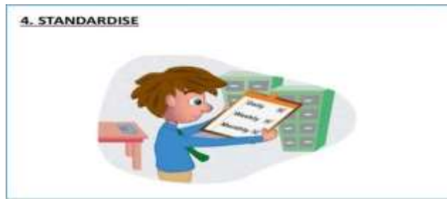
Figure2.4: 4S-STANDARDIZE (Seiketsu)