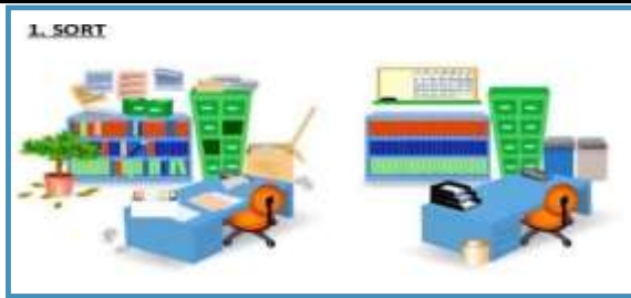
Figure2.1.: 1S -Short (Seiri)