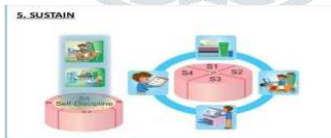
Figure2.5: 5S- SUSTAIN (Sitsuke)