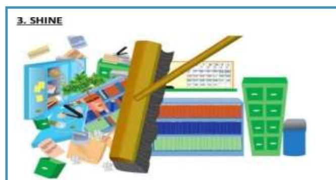
Figure2.3: 3S-SHINE (Seiso)