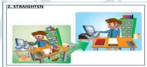
Figure2.2: 2S-SET (Seition)