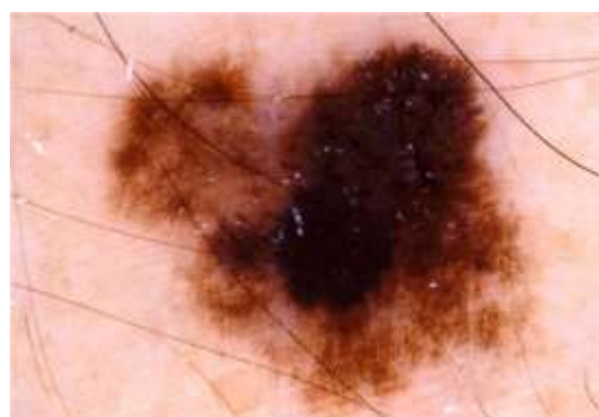
Fig. 3 Skin Cancer Image