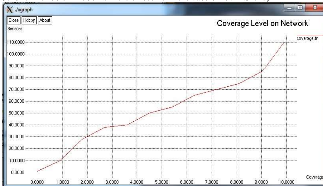
Fig.2 Number of sensors versus Coverage of a Network

achieving full coverage. We can see that the fusion model can reduce 100% of sensors compared to the disc model in a wide range of PSNRs, i.e., from 15 to 37 dB. The fusion model is more effective in the case of low PSNRs,