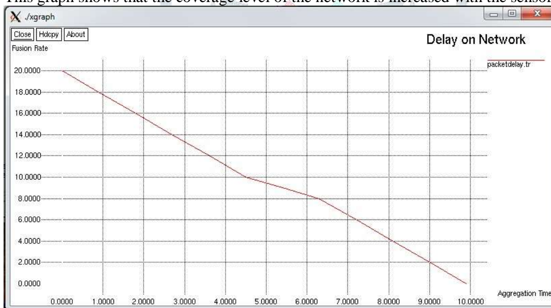
Fig.3 Fusion Rate versus Aggregation Time

This graph shows that the coverage level of the network is increased with the sensors.