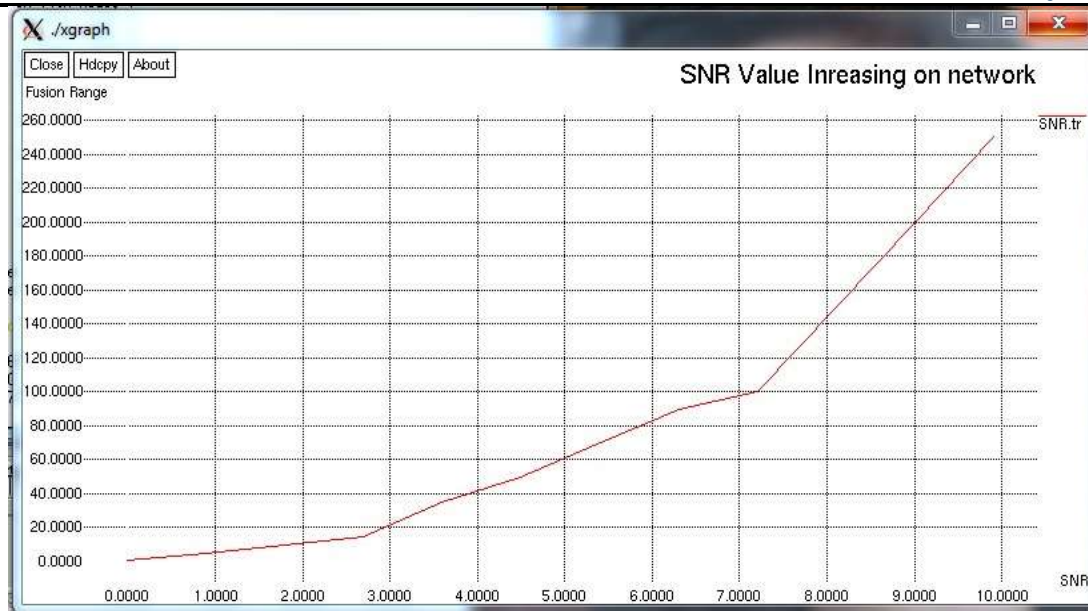
Fig 4 Fusion Range of a network versus Signal to Noise ratio

As the Signal to Noise Ratio is increasing the Fusion Range of a network also increases.