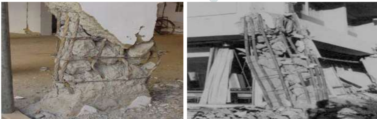
Figure 3: Shear Failure of Column