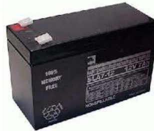
Fig : Rechargeable Battery

Rechargeable batteries have lower total cost of use and environmental impact than disposable batteries. [13] Some rechargeable battery types are available in the same sizes as disposable types. Rechargeable batteries have higher initial cost but can be recharged very cheaply and used many times. During charging, the positive active material is oxidized, producing electrons, and the negative material is reduced, consuming electrons. These electrons constitute the current flow in the external circuit. The electrolyte may serve as a simple buffer for internal ion flow between the electrodes, as in lithium-ion and nickel-cadmium cells, or it may be an active participant in the electrochemical reaction, as in lead-acid cells.