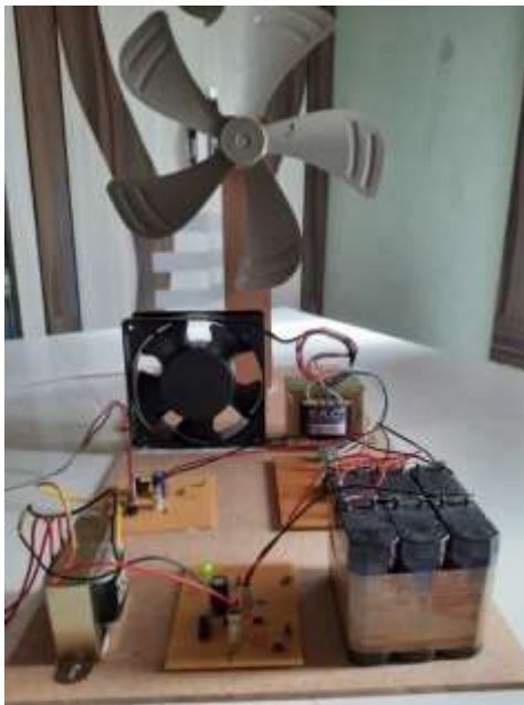
Fig: Image of DUAL APPLICATION WIND MILL FOR ON-GRID AND OFF-GRID APPLICATIONS

The paper represents an innovative idea on “DUAL APPLICATION WIND MILL FOR ON-GRID AND OFF-GRID APPLICATIONS” which is mainly intended to design a system which makes the induction motor running through Wind energy possible. It can be made to run through the On-grid power or the available wind power stored in the batteries from the wind energy through Off-grid. The system depending on the selection switch status either directly runs the motor through inverter through Wind power or stores the energy to a battery and then runs the motor through the inverter. The project makes use of a wind turbine. The wind energy obtained is stored to a battery. The battery supply is fed to pulse generator and in turn to a MOSFET which is capable of generating ON/OFF pulses of different frequencies. This is fed to a step-up transformer to generate a low voltage AC. This AC is fed to appliance like induction motor of single phase.