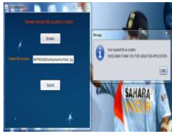
Figure Save the File Image