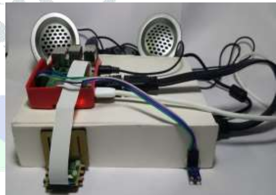
Fig. 4.5: Lateral View