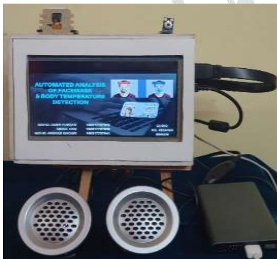
Fig. 4.3: Front View