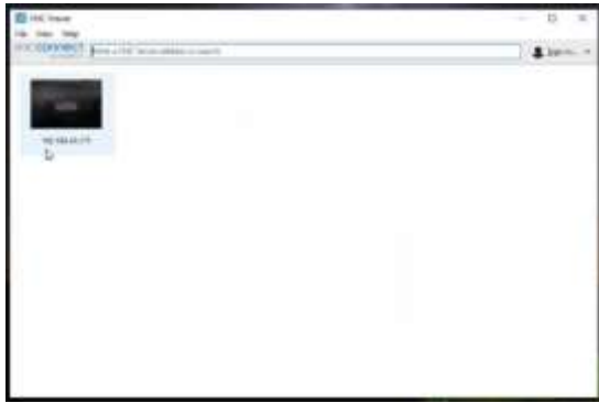
Fig. 4.1: Advanced IP Scanner