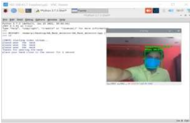
Fig. 4.7: Mask and Body Temperature detected