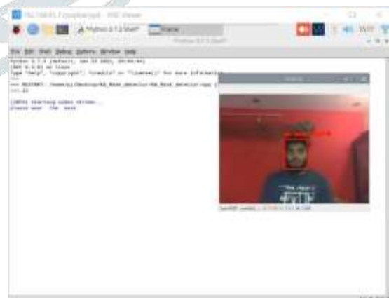
Fig. 4.6: No mask detected