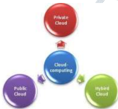
Fig. : 2 : Model of cloud computing

The cloud infrastructure is a composition of two or more clouds (private, community, or public) that re-main unique entities but are bound together by standardized or proprietary technologythat enables data and application portability.