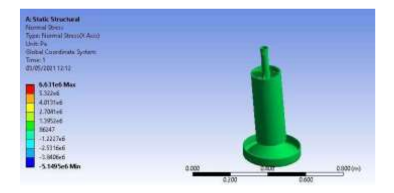
Figure 5: Stress distribution

This above figure 4 represents shows the mesh generated on the chicken feeder and shows number of nodes taken is 72334 and elements taken is 39338 while generating the mesh. The figure 5 shows the deformation produced after the addition of feed into the component and the total deformation obtained is 2.25 \times 10^{-6}