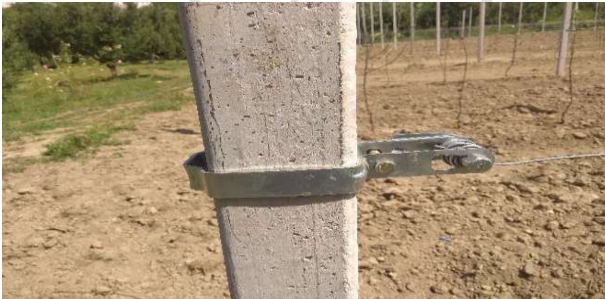
Figure 4. A collar is attached to the End-Pole to hold the trellis wire of 2.2mm dia. firmly