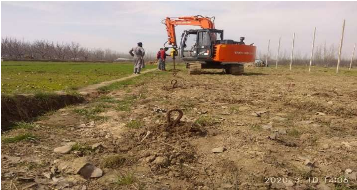
Figure 3. Installation of Anchorages at Pulwama J&K.