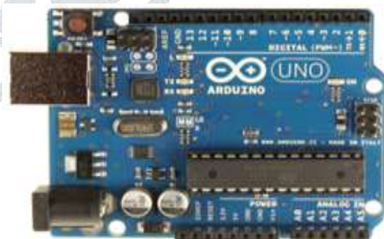
Figure 2: ARDUINO UNO