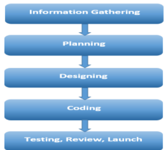
Figure 1. Work flow of Proposed System