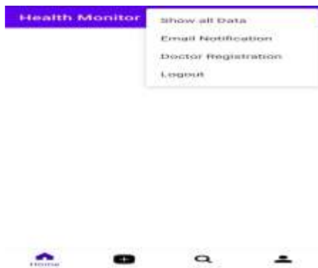
Fig2: Home Page