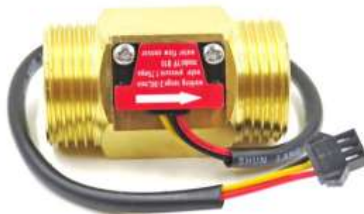
Fig 1:- Water flow sensor of 1 inch diameter

Water Flow Sensors. :- They are used for measuring the water flow. It has a turbine on the inner side which rotates when the water flows through them. The range of measurement of a 1 inch flow sensor is 4 to 40 liter per minute as shown in fig 1.