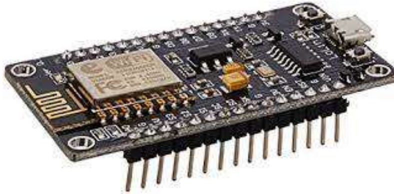
Fig 2:-Node MCU

Node MCU :- It is a kind of microcontroller. It is used basically for quantization and sampling of data. In other words we can say that all the data processing and calculation take place in Node Mcu. It also contains an inbuilt Wi-Fi module which helps in transferring of processed data to the server as shown in fig 2.