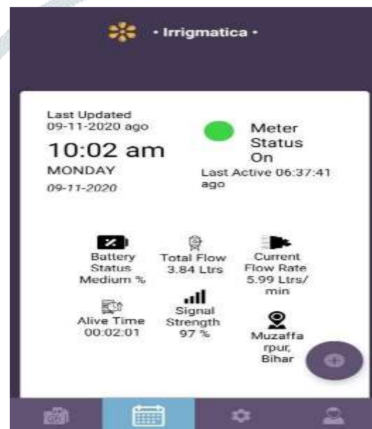
Fig 6:- Dashboard of Application