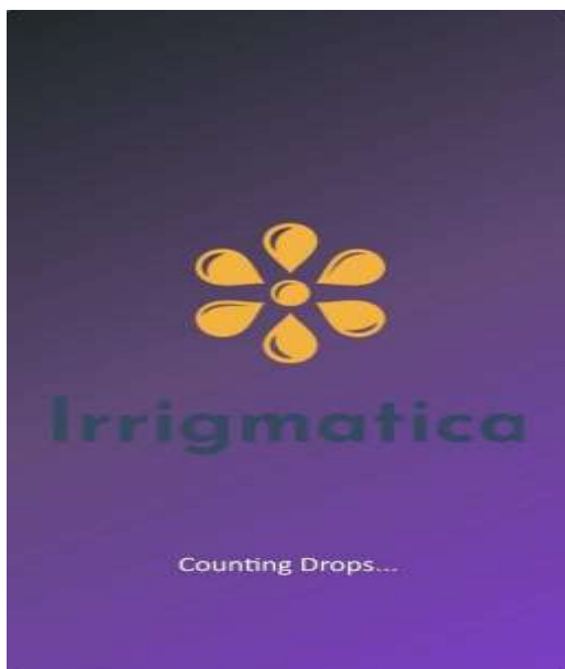
Fig 5:- Interface of Application

The data from the Node MCU is transferred to the cloud. The data is stored in the firebase real time data base. The relevant and processed data is fetched from mobile application which is compiled using the android SDK (Java) through HTTP protocol .The developed tool Irrigmatica interference is shown in fig 5. Application Dashboard is shown in fig 6 . This application can be logged through Facebook, Gmail etc. as shown in fig 6. Real time graph is shown in fig 7.The composition from both ends are (1) Front end: - Android SDK (Java) (2)Back end: - Firebase