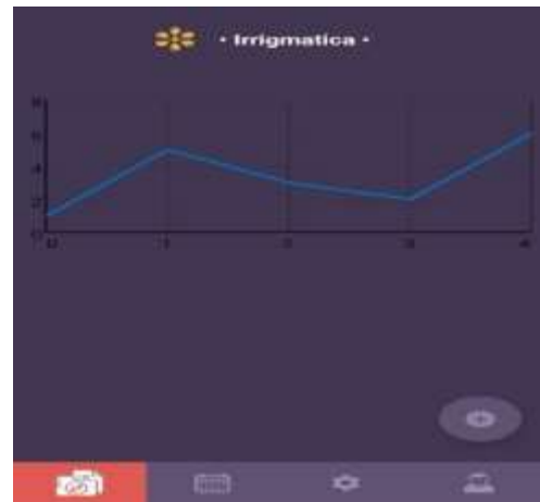
Fig 8 :- Real time flow graph