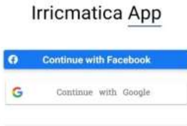
Fig7:- Get through