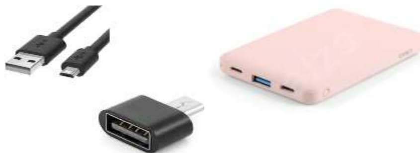
Fig 4:-Battery & Adaptor

Connecting cables: - They are used for power connection and data transfer as shown in fig 4.