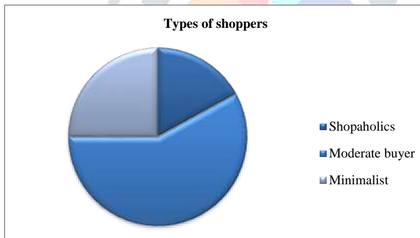
Figure 3.3: Types of shoppers

After collecting the data, all three categories were studied and analyzed further as a whole of 100 samples (Figure 3.3).