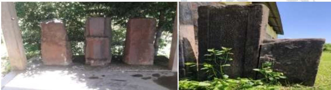
REMAINS OF PRATAPGARH KINGDOM ( PATHARKANDI )

Thus, it can be concluded that Pratapgarh kingdom eventually led to the introduction of zamindarship in Karimganj subdivision ( Sylhet ). The disintegration of Pratapgarh kingdom exposed commercial activities linking different region and developing socialization and cultural harmony among people. It also led to the introduction of various land revenue act by the government ultimately legalizing all the act to be followed aftermath. In the later period , a portion of Pratapgarh was renamed “ Patharkandi “. Thus Pratapgarh kingdom led to the beginning of a new era in the history of Barak valley.