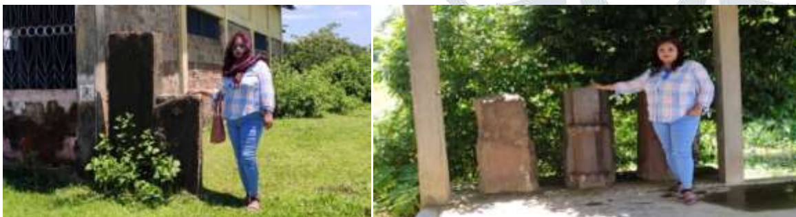
VISIT TO PRATAPGARH ( PATHARKANDI )