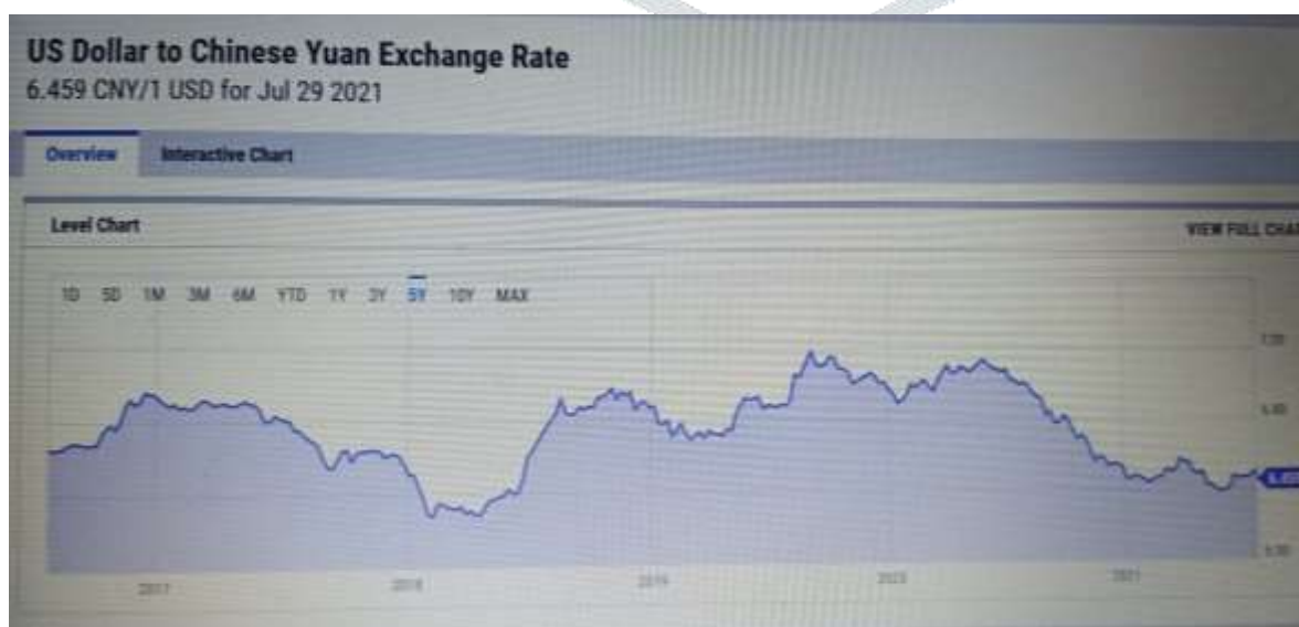
Figure 2. Real exchange rate of the US dollar relative to the yuan

The dollar appreciated against the Chinese yuan by 11% from USD 0.136 per yuan in January 1999 to USD 0.121 in June 2005. Since July 2005, the dollar depreciated by 26% to USD 0.153 per yuan in December 2008. The first six months of 2009 saw a new depreciation in the real exchange rate of the yuan (by 2%) which has motivated authorities in some countries as well as international bodies to pressure the Chinese authorities to allow their currency to appreciate in order to help resolve world trade imbalances. The yuan depreciated by about 6 % relative to the euro in real terms over the first six-month period of 2009.