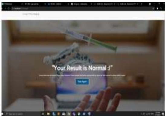
Figure 5 – Result screen