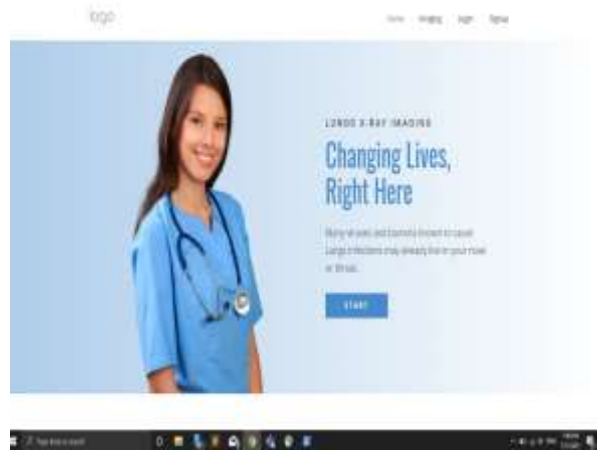
Figure 2- Demo Image