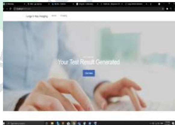
Figure 4 – test screen