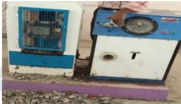
Figure 1: Compression testing machine

A compression testing apparatus is made use of find out the strength of compression. It's pushed till it snaps. The examples were made with Eco sand and Foundry sand with varying amounts of cement. Bricks must have a lowest amount compressive strength of 3.50 N/mm 2 according to BIS: 1077-1957. Figure 2 shows the bricks with compressive testing equipment. The compressive strength of bricks for various curing days was recorded in tables 5, 6, and 7, and a comparative study of compressive strength was presented in graphs 2.