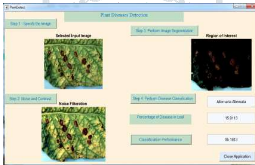
Fig 2 Implementation