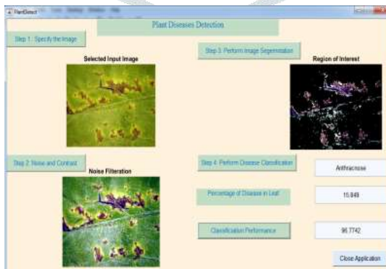
Fig 6 Result of Classification and Accuracy Sample 2 Anthracnose