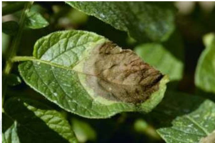
Fig 1 Plant Diseases

Plant diseases will be widely arranged by the idea of their fundamental causative trained professional, either compelling or no contagious. Powerful plant diseases square measure brought about by an unhealthful animal, for instance, Associate in Nursing life form, bacterium, mycoplasma, contamination, viroid, nematode, or parasitic blossoming plant. Partner in Nursing overpowering administrator is provided for copying inside or on its host and spreading starting with one nerveless host then onto following. no contagious plant diseases square measure brought about by monstrous creating conditions, along with limits of temperature, destructive associations among wetness and gas, hurtful substances inside the soil or environment, And=d a bounty or inadequacy of an essential mineral. Since no contagious causative administrators don't appear to be animals fitting copying inside a bundle, they're not contagious. [3]