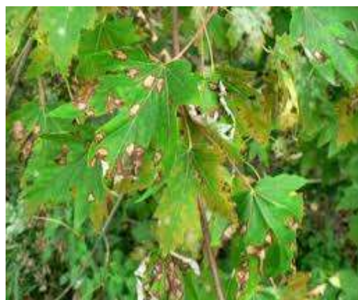
Fig 3 Test Sample 1 for Anthracnose