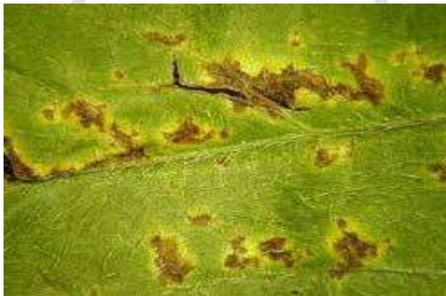
Fig 5 Test Sample 2 for Anthracnose