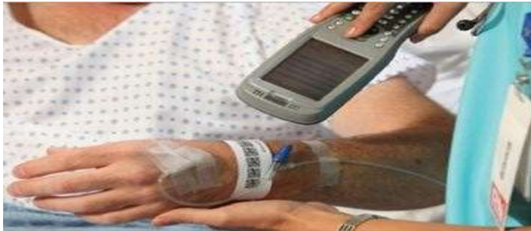
Fig 7: Bar code medication scanning [35]