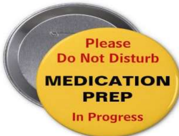
Fig 2: Decreasing the rate of interruptions during medication preparation [28,29,30].