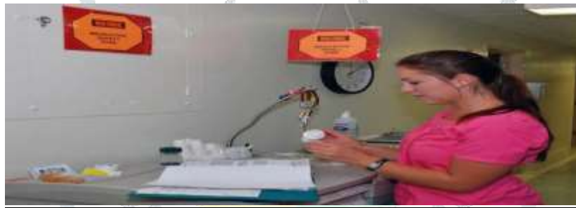
Fig 1: Minimizing the rate of interruptions during medication preparation [28,29,30].

Nurses should know the reasons of work disturbance and put plan to avoid and to reduce the patient risk. The effective plan for medication administration that could separate the medication preparation in special area, and put signal determine that this area should be free from interruption in addition to continuous health education for nursing and encourage for collaboration between nurses and how to use the time efficiently and restrict the number of visitors to minimize disturbance. Nurses staff can put accurate documentation of drugs and time of administration [28].