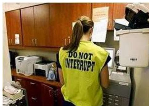
Fig 3: Diminishing the rate of interruptions during medication preparation [31,32].