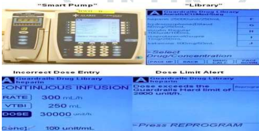
Fig 5: Smart pump drug libraries [34]