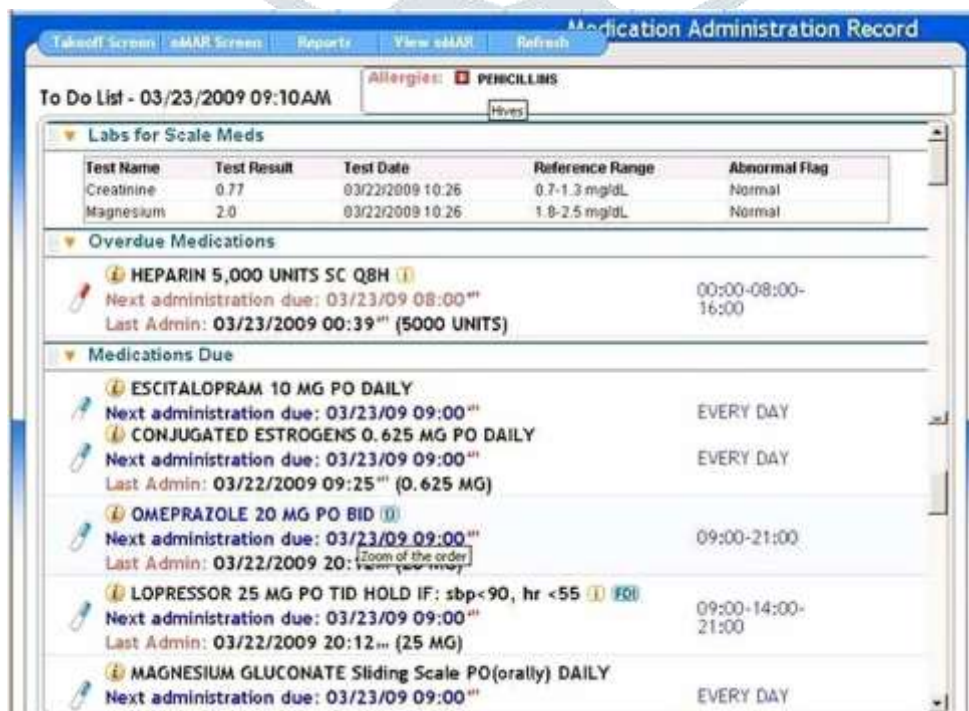
Fig 6: Electronic medication administration record [34]