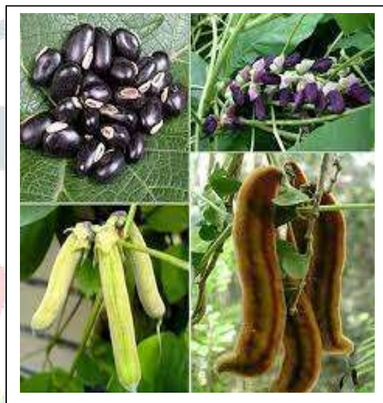
Fig.2 Seeds of Mucuna Pruriens

cultivated as a green vegetable crop. It is one of the most popular green crops currently known in the tropics; velvet beans have great potential as both food and feed as suggested by experiences worldwide. The velvet bean has been traditionally used as a food source by certain ethnic groups in a number of countries. It is cultivated in Asia, America, Africa, and the Pacific Islands, where its pods are used as a vegetable for human consumption, and its young leaves are used as animal fodder. The plant has long, slender branches; alternate, leaves; and white flowers with a bluish- purple, butterfly-shaped corolla. The pods or legumes are hairy, thick, and leathery; averaging 4 inches long; are shaped like violin sound holes; and contain four to six seeds. They are of a rich dark brown color, and thickly covered with stiff hairs. In India, the mature seeds of Mucuna bean are traditionally consumed by a South Indian hill tribe, the Kanikkars, after repeated boiling to remove anti-nutritional factors. Most Mucuna spp. exhibit reasonable tolerance to a number of abiotic stresses, including drought, low soil fertility, and high soil acidity, although they are sensitive to frost and grow poorly in cold, wet soils. The genus thrives best under warm, moist conditions, below 1500 m above sea level, and in areas with plentiful rainfall. Like most legumes, the velvet bean has the potential to fix atmospheric nitrogen via a symbiotic relationship with soil microorganisms.