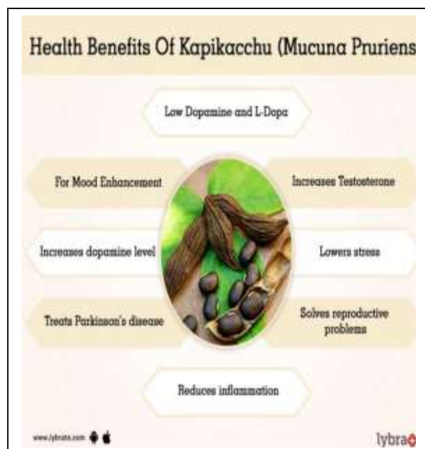
Fig.3 Health benefits of Mucuna Pruriens