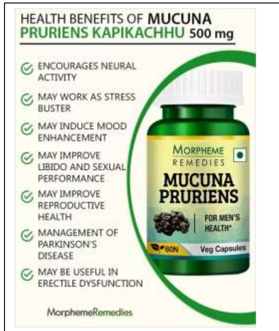
Fig. 7 various uses of Mucuna Pruriens

The skin is one of the main targets of several exogenous insults such as UV radiation, O 3 , and cigarette smoke, and all of these exert toxicity via the induction of oxidative stress. Several skin