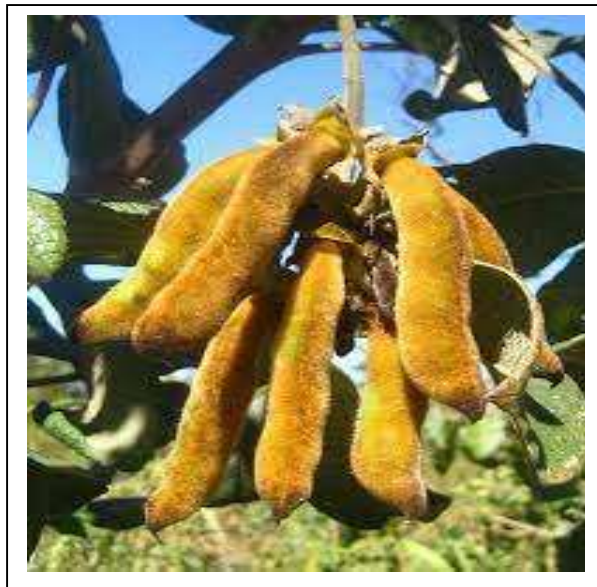
Fig.1 Mucuna Pruriens

The plant Mucuna pruriens , widely known as “velvet bean,” is a vigorous annual climbing legume originally from southern China and eastern India, where it was at one time widely