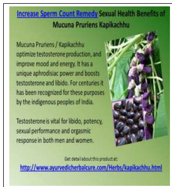
Fig.4 Health benefits of Mucuna Pruriens

In small amounts (approximately 0.25%) L-dopa corresponds to methylated and non-methylated tetra hydro iso-quinoline . These substances are present in the Mucuna roots, stems, leaves, and seeds. Other substances are present in different parts of the plant, among which are N,N-dimethyl tryptamine and some indole compounds. Alcoholic extracts of the seeds were shown to have potential anti-oxidant activity in in vivo models of lipid peroxidation induced by stress. On the other hand, Spencer et al. (1996) have reported that the pro-oxidant and anti-oxidant actions of L-dopa and its metabolites promote oxidative DNA damage and could also be harmful to tissues damaged by neurodegenerative diseases, namely Parkinsonism. Moreover, a study using in vitro models revealed that L-dopa significantly increases the levels of oxidized glutathione in rat brain striatal synaptosomes. The observed depletion of reduced glutathione (GSH) could be due to the generation of reactive semiquinones from L-dopa.