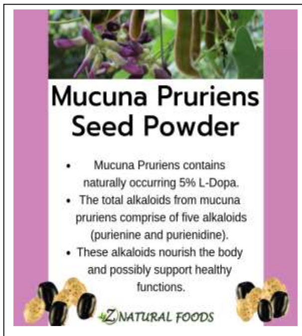
Fig.5 Constituents of Seed of Mucuna Pruriens