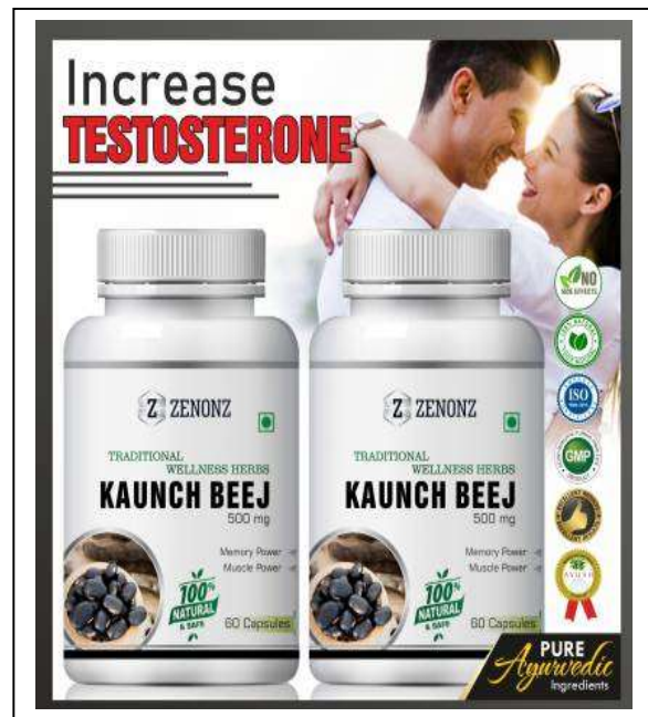
Fig.8 Mucuna Pruriens increases testosterone Level in male

pathologies, such as psoriasis, dermatitis, and eczema, are related to increased oxidative stress and ROS production, and research investigating novel natural compounds with anti-oxidant properties is an expanding field. As mentioned above, certain plant-derived compounds have been an important source of traditional treatments for various diseases, and have received considerable attention in more recent years due to their numerous pharmacological properties. Recent preliminary studies from our group have shown that human keratinocytes treated with a methanolic extract from MP leaves exhibit down regulation of total protein expression. In addition, treatment with MP significantly decreased the baseline levels of 4HNE present in human keratinocytes. This preliminary study suggests that evaluating the effect that topical MP methanolic extract treatment may have on skin diseases would be worthwhile, as would further work aimed at clarifying the mechanisms involved in such effects.