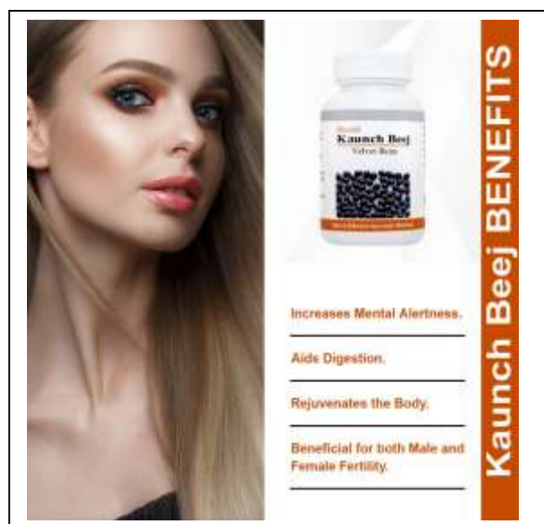
Fig.9 Mucuna Pruriens Beneficial for male and female fertility