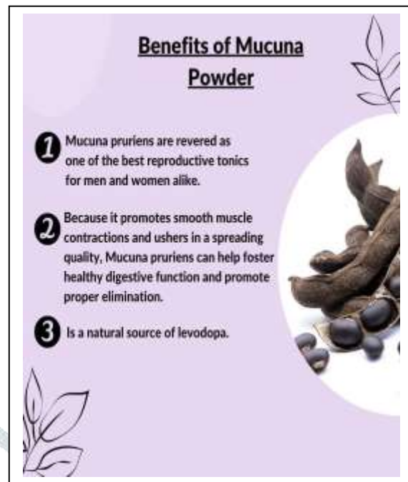
Fig.6 Benefits of Powder of Mucuna Pruriens

Among the ancient Unani scholars, the father of medicine, Hippocrates (460 B.C.) who was the first to recognize Parkinson's disease symptoms, i.e. Ra'asha quoted by Zakaria al-Razi. One such quote described in Al-Hawi Fi al-Tib is as follows: