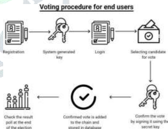
fig2. Voting procedure

Once the vote has been verified, it will then be turned into a block and added to the blockchain, the transaction history of the user will be updated to prevent the same user from casting multiple votes.