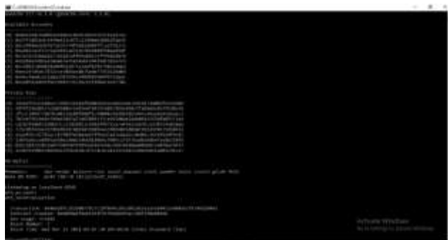
Fig 1 shows a command prompt which uses blockchain to act as database and various ID's reflects the current accounts that have voted to the candidates as well as private keys corresponding to these accounts.

For further advancements in the implementation with proper infrastructure and resources it is possible to implement the database on a distributed architecture to prevent it from having a central authority on the elections and decentralizing the whole process.