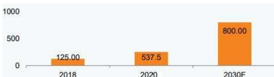
Figure-2, Indian E-commerce Market (US$ billion) (US$ billion)