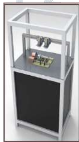
Fig 3: Chamber