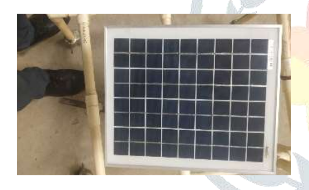
Figure. solar panel

SOLAR PANEL: A solar cell or photovoltaic cell , is an electrical device that converts the energy of light directly into electricity by the photovoltaic effect which is a physical and chemical phenomena light shining on the solar cell produce both a current and a voltage two generate electric power