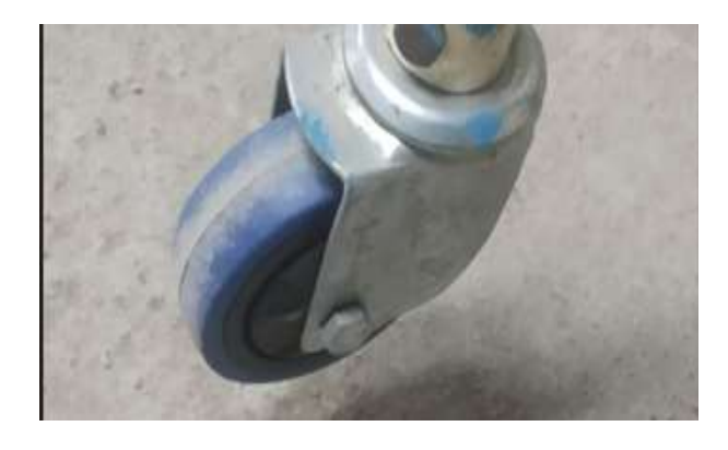
Figure. Caster wheel

SWITCH: We have used the ON OFF the blade.