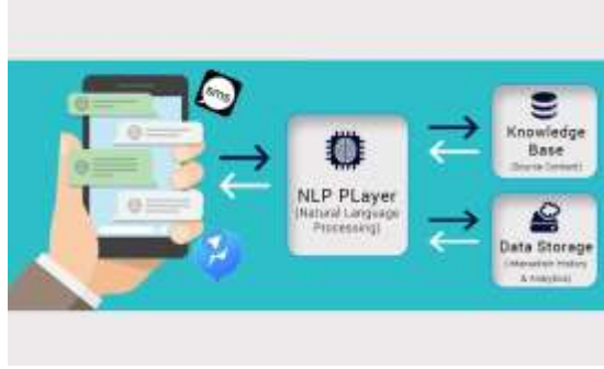
Fig 3. NLP Player