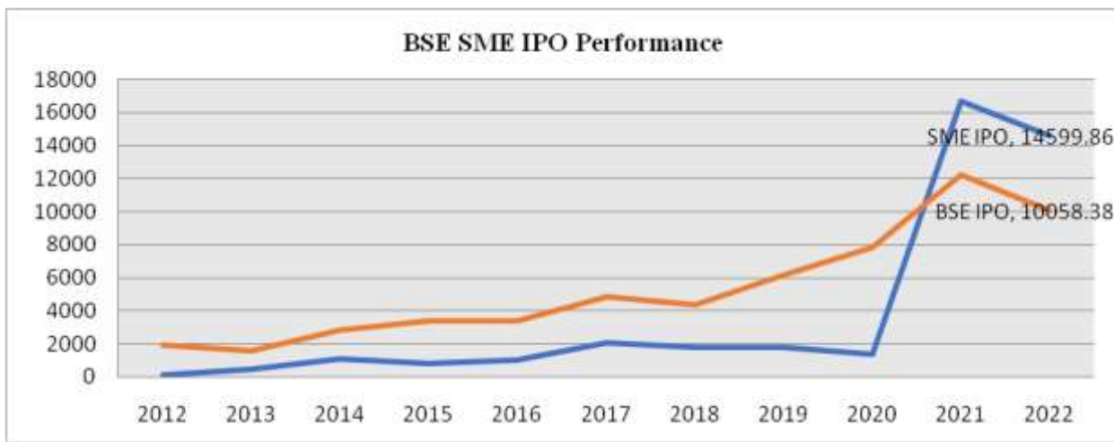
Figure 1 BSE SME IPO Performance