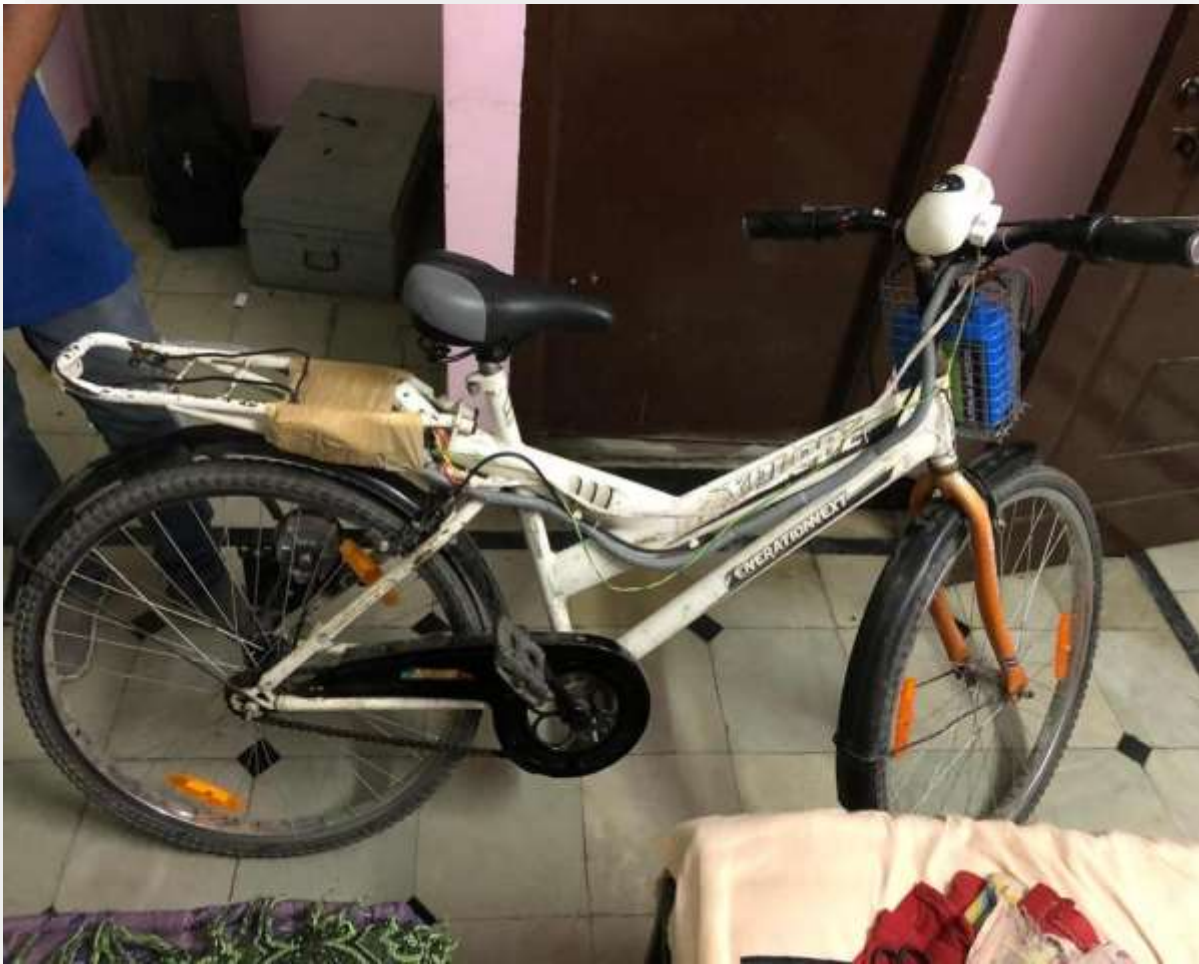
Figure 3 Practical working of project