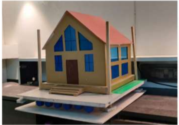
Figure 2. Project Prototype made by ( 1 Meghanjali Rao, 2 Akash Patil, 3 Mrunmai Gaikwad, 4 Ashwin Bagul)