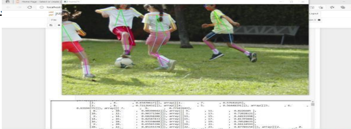
Fig 3: Human pose in the video