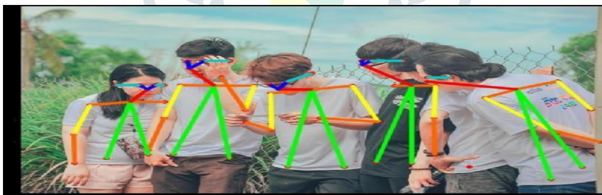
Fig 2: Human pose result