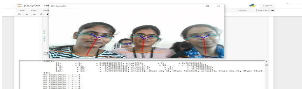
Fig 4: Human pose in live camera