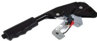
Fig-4: Hand Brake Lever

Hand Brake lever is used to apply and remove brake. It is not used in running vehicle, only used in park vehicle.