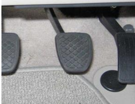
Fig-5: Brake Pedal

It is foot operated lever operated by foot when car is in running condition to stop the car as well as to reduce the vehicle speed. There are three different types of pedals in vehicle Accelerator pedal, Brake pedal, Clutch pedal.