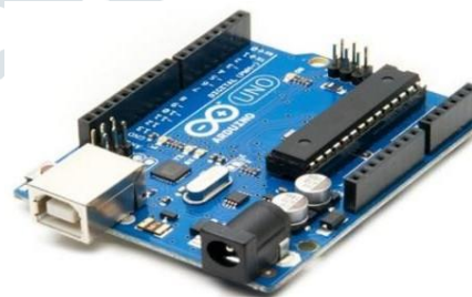
Fig-8: Micro-controller and electric circuit

In our case this passes the signal to motor to operate by taking input from three different things like seat belt, ignition switch, and foot brake pedal.