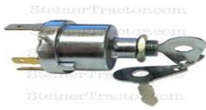
Fig-2: Ignition Switch

Ignition switch is used to start the engine of a vehicle.