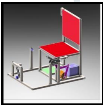
Fig -9: 3D CAD Model

Below 3D CAD model is representation of actual seat belt assisted hand brake system, where electric battery transfers the current to microcontroller unit, this microcontroller unit consists of cable connections linked with components of vehicle like ignition switch, seat belt, and brake pedal via push button, when all these components cable connections meet the criteria as per above table. Microcontroller unit sends the signal to electric motor to rotate motor shaft clockwise and anti-clockwise accordingly.