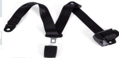
Fig-7: Seat Belt

Seat belt safety harness used in four wheel and above vehicle. It so important for the safety of driver and co passengers avoiding and not paying attention to this may cause serious injury and sometimes death.