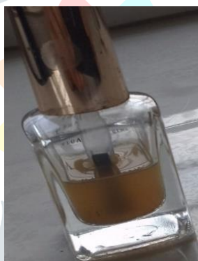
Fig no. 3 nail lacquer

Nitrocellulose and ethyl cellulose were dissolved in sufficient quantity of ethyl acetate to get clear solution. Salicylic acid was dissolved in above mixture and dibutyl phthalate was added. Then extract of C. quadrangularis and acetone were added with continuous stirring at 100 rpm on magnetic stirrer. The formulations were coded as F1 to F4. Finally, sufficient quantity of ethyl acetate was added to get proper consistency to nail lacquer (Figure 6). 26