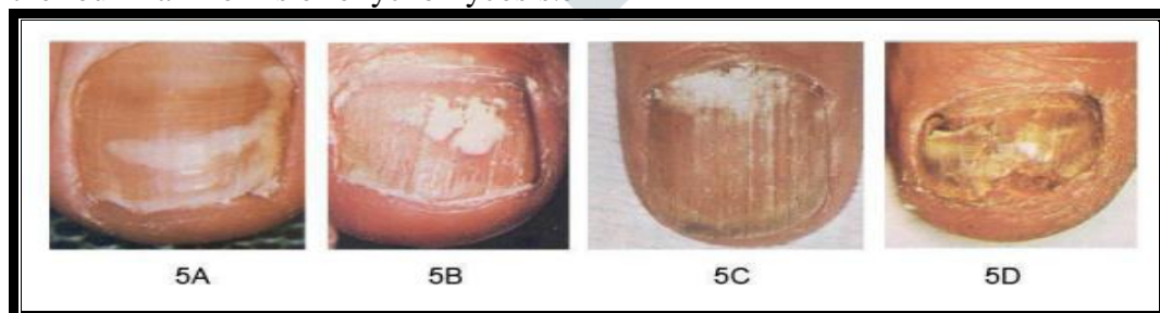
Fig. no. 2 Classification of Onychomycosis

E. Total Dystrophic Onychomycosis Total dystrophic onychomycosis may be the end result of any of the four main forms of onychomycosis. 5D