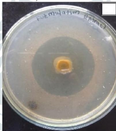
Fig. no. 4 zone of inhibition of extract

6) Antifungal study of formulations - Antifungal activity of C. quadrangularis extract nail lacquer was evaluated by cup plate method against Candida albicans . The sterilized sabouraud dextrose media was poured to the sterilized petri plates and allowed to set. Bacterial culture was inoculated on the media in aseptic condition. Wells were prepared aseptically with sterilized cork borer. 21 Wells were filled with each 0.8ml (50mg/ml) following solution in DMSO: A: Cissus quadrangularis extract loaded formulation (0.8ml). Plates were kept for pre-diffusion in refrigerator for 15 min. After normalized room temperature, all plates were incubated at 30°C for 48 hr. Zone of inhibition (diameter in mm) was measured.