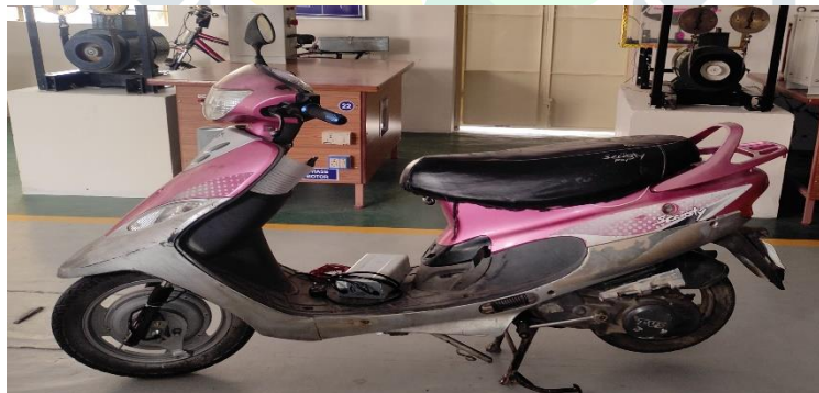
Figure 2 Proposed system of Hybrid electric vehicle