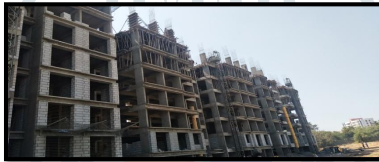
Figure 4 - Under-construction Multi-Storey Building at Parksyde Homes

The case study considered for the present work is an ongoing project of Jaikumar Construction, one of the renowned developers in the city of Nasik, M.S. This is a high-rise residential mass-housing project comprising of a total of Five Construction Phases. Out of the total Five Phases, Three Phases have been already handed over. The Fourth phase is about 90 percent complete, while the last phase is under construction. Masonry work is done in Autoclaved Aerated Concrete (AAC) Blocks.