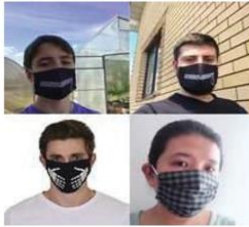
Fig.2. Kaggle dataset Sample images