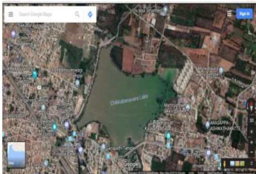
Fig. 1: Google View of Chikkabanavara lake