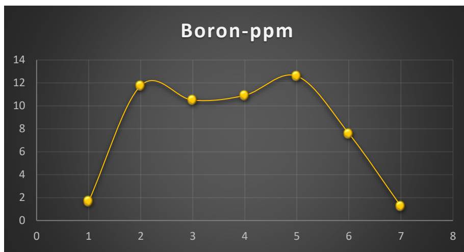
Fig. 5: Variation of Boron