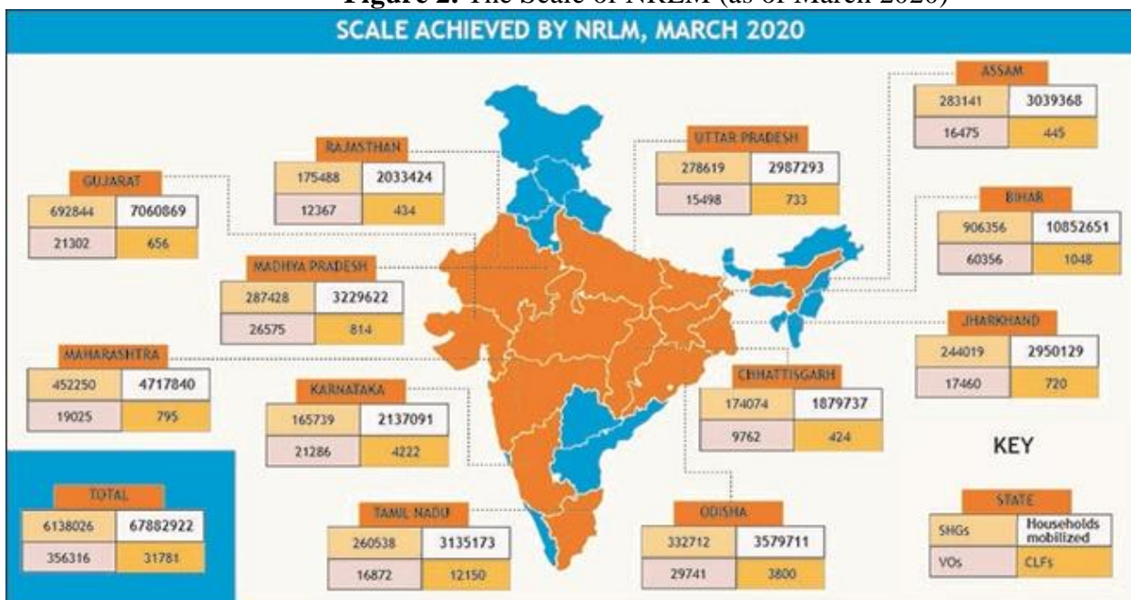
Figure 2. The Scale of NRLM (as of March 2020)

Note on Key: VOs – Village Organisations; CLFs – Cluster-Level Forum