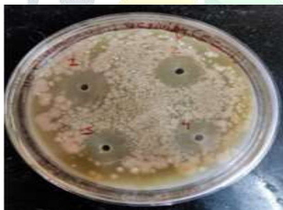
Figure 2. Zone of inhibition observed around the wells, well no 1 & 2 contains Goat milk sample, well no. 3 Contains Buffalo milk sample and well no. 4. Contains Cow milk sample on MRS media containing plate pre-inoculated with E. coli suspension.

The antimicrobial activity of lactobacillus was determined by the agar well diffusion method. The antimicrobial activity is determined against some pathogenic strains such as E. coli , S. aureus which is basically part of the normal gut flora and these organisms are also known as enteric pathogens.