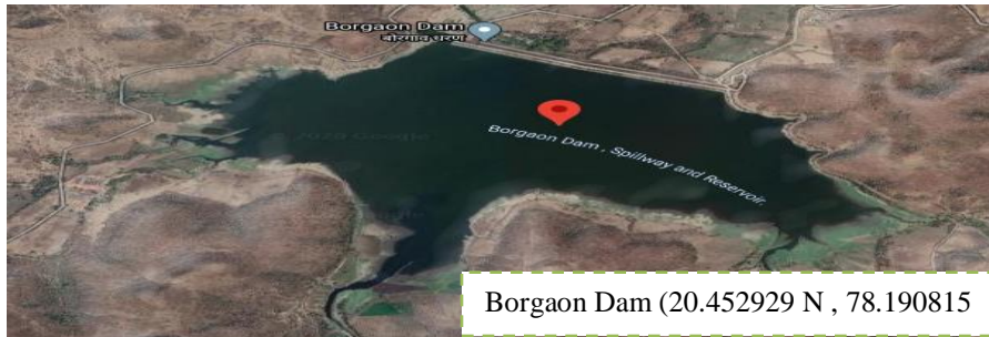
Picture1 -- Google map of Borgaon Reservoir

Borgaon Dam is located at a distance of 11 km towards East north direction of Yavatmal city (20.452929 N , 78.190815 E). Good number of waterfowl including migratory and residential can be recorded mainly west and south sides of the dam where the healthy wetlands are developed. During the study period from 2016 to 2021 particularly in the summer morning and evening hours were fixed for observations of wetland and this will continue up to end of summer.