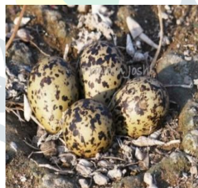
Photo-8 Black Winged Stilt