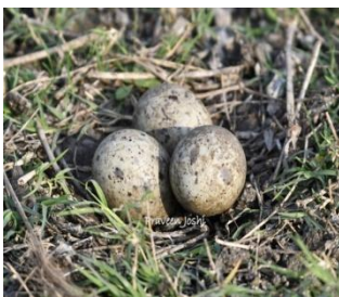
Photo-6 River Tern

Despite all these hurdles, some eggs survive and are incubated and hatchlings are born, but due to this constant work, they lose their lives needlessly and the parents can do nothing but watch in agony. For the same reasons, waterfowl have to wait until next year for breeding, but even then, this is happening again and slowly the birds are starting to escape from the dam. Breeding, eggs and nestlings of water birds recorded till date at Borgaon Dam include Little Tern, River Tern, Small Pratincole, Kentish Plover, Little Ringed Plover, Great Thick-knee, Red wattled Lapwing, Yellow wattled Lapwing and Black Wing Stilt. Breeding photos of some of these waterfowl including eggs and chicks are a common sight at the Borgaon dam in summer.