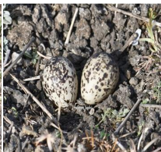
Photo-12 Yellow Wattled Lapwing