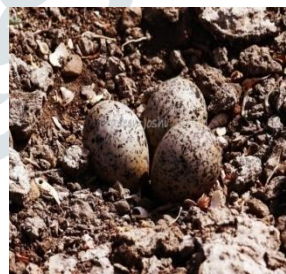
Photo-9 Little Ring Plover