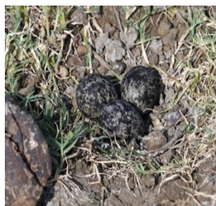
Photo-11 Oriental Pratincole