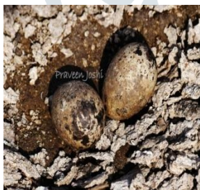
Photo-7 Great Thick-knee