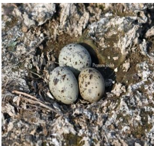
Photo-10 Little Tern