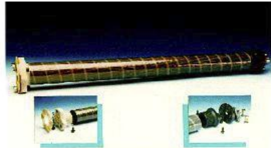
Fig.2. Photographic view of a one-piece composite drive shaft