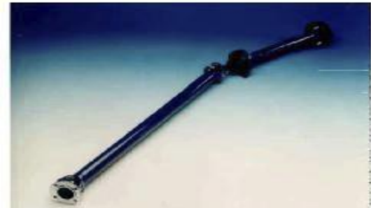
Fig. 1. Photographic view of a two-piece steel

Drive shafts are usually made of solid or hollow tube of steel or aluminum. Over than 70% of single or two-piece differentials are made of several-piece propeller shaft that result in a rather heavy drive shaft. Fig. 1 and 2 shows a photographic view of two-piece steel and a sample composite drive shaft respectively. Composite drive shafts were begun to be used in bulk in automobiles since 1988. The graphite/carbon/fiberglass/aluminum driveshaft tube was developed as a direct response to industry demand for greater performance and efficiency in light trucks, vans and high performance automobiles. The main reason for this was significant saving in weight of drive shaft; the results showed that the final composite drive shaft has a mass of about 2.7 kg, while this amount for steel drive shaft is about 10 kg. The use of composite drive shafts in race cars has gained great attention in recent decades. When a steel drive shaft breaks, its components, are thrown in all directions such as balls, it is also possible that the drive shaft makes a hole in the ground and throw the car into the air. But when a composite drive shaft breaks, it is divided into fine fibers that do not have any danger for the driver.