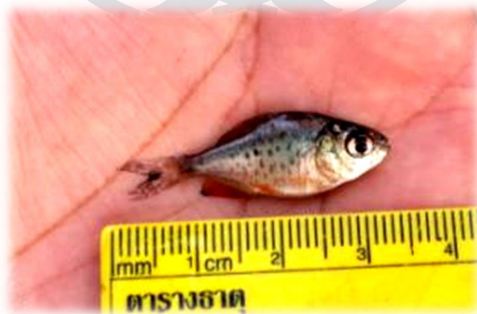
Figure 3. Length of the Piaractus brachyomus was measured by Centimeter Scale.

The experiment was carried out in one control and three experimental ponds. All the experimental ponds were dewatered and dried for 15 days before stocking. The purpose of the sun direct pond is to disinfect the pond and stabilize pH limiting the pond with \text{CaCO}_3 was applied at the rate of 125 kg/ha with the dusting method [11, 49]. Precautionary measures were taken to avoid any unimportant material in the pond. After removing the sediment, 50 to 100 ltr/ha of Super PS may be sprayed over the soil to utilize the organic matter and establish a beneficial bacterial community. After two weeks of pre-stocking, the ponds are watered up to 1.5 to 2.0 m, and this water level was maintained throughout the experimental period. After two weeks of pre-stocking and manuring the pond, each pond was stocked with Piaractus brachyomus . This study is a monoculture that includes only Piaractus brachyomus . The length and average body weight of fishes were noted at the time of stocking. At the time of stocking, fingerlings' size (length of the fish) was measured by centimeter-scale, and the weight of the fish was measured by electronic balance.