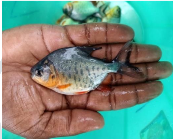
Figure 1. Piaractus brachypomus

Fingerlings of Piaractus brachypomus (Fig:1) collected from government fish farm at Kovur Mandal, Nellore District, Andhra Pradesh, were brought and acclimatized to the laboratory conditions. Fingerlings of fish were collected from the local fisheries department as per the standard pisci culture procedures and were kept in cement tanks for a week with sufficient aeration and declorinated water to acclimatize them to laboratory conditions.