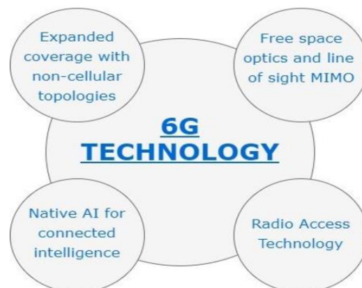
Figure 2: Fundamental groups for 6G Technology

We can imagine three important service scenarios in 6 th generation. They are massive broadband URLLC (ultra-reliable low latency communications), Zero energy massive IOT and ultra-broadband [19]. In a 6G world with a minimum energy consumption we can fulfill the massive broadband dual LLC demand. To develop new access technology there are multiple big challenges such as multiplexes, channel coding, modulation multiplexes, waveforms, and full duplex etc. The desired features and necessity in 6G are to achieve low processing latency, low complexity and other technical requirements.-The following figure 2 shows the groups for 6G technology.