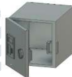
Fig 4: 3D design of locker

The simulation takes into account factors such as weight distribution, stress points, and potential vulnerabilities to ensure that the final product is reliable and durable. With this level of precision and attention to detail, the safety locker is sure to meet the highest standards of quality and performance.