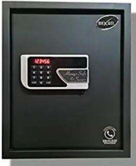
Fig 3: An example locker

data. They share the data they collect by connecting to an IoT gateway or other edge device, which then either analyses the data locally or sends it to the cloud for analysis. IoT devices often communicate with each other and perform tasks autonomously, but can also be interacted with by human for setup, instruction or data access.