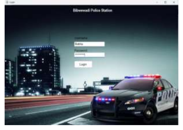
Fig[2]: Login Page

It contains 6 windows forms where the first form is the login after logging in to the application the Dashboard form opens and We can go to any one of the forms that is the cases form, criminals form, charges form and the officer form and we can also logout from any page. The username and password is developed to provide a secure data base record where the Officer's name and password stored in the officer form is the username and password. If we add an new officer, then his username and password would be automatically created and stored and gets the access of the application. In the cases form if we select the criminal id the that particular criminals name would directly occur in the criminal textbox. For getting this code we must store the criminal information in the criminal's form and the code is automatically generated which is unique for everyone. Similarly, the case code is also generated automatically after storing the case information and this code is used on the charges form and the heading of the case would occur in the allotted textbox automatically. We do not need to continuously look for the which case id which heading is stored or for which criminal id which criminal's name is stored, the user just must enter the code and the adjacent information would occur directly. If we press the Logout we return to the login page and the program would stop if any only if we stop the execution