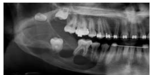
Fig 4: Dental Cyst