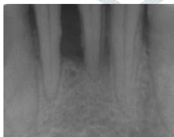
Fig 3: Periodontal Disease