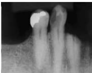
Fig 2: Dental Caries

Using Kaggle (Planmeca Intra, Helsinki, Finland), MyRay, and other software, photos from private dental and oral health clinics were gathered assessed. There were 980 patients and a total of 1181 periapical pictures that were examined. 101 pictures, some of which were blurry or showed fractures, cysts, and infections the study's exclusion. The study only contained a few periapical pictures out of 1181 total photos. It was done to establish a dataset of patient-provided periapical radiography images. Under the supervision of a dentist, this dataset was collected. Gray channels with different sizes were present in these photos. Dental periapical pictures from the dataset are shown in samples in Figures 2, 3, and 4 referred for this study.