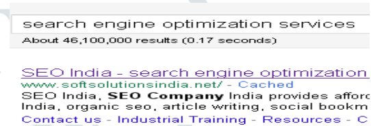
Figure 4: Figure showing title optimisation

Following screenshot shows how search engine gives it relevance when fetching out user query.