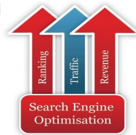
Figure 12: Figure showing SEO impact percentage