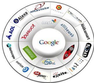
Figure.1 Search engine optimisation