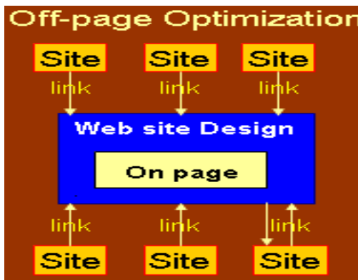
Figure 3: Figure showing off page optimisation [7]