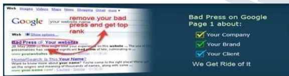
Fig 11: Reputation management in search engine optimisation

Search engine reputation management helps to move out of the first result pages those negative posts. It can help to bring back the good name, it helps in keeping business reputation preserved and protected. Each and every corner of the website is monitored and effective measures to protect a good reputation are taken. In brief this service takes effective measures to protect a good reputation and prevents other to damage the reputation.