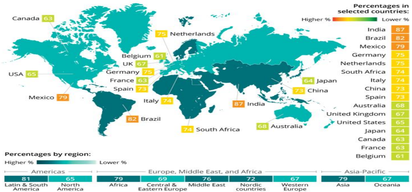
Fig- 2: Digital HR practice worldwide and its percentage of utilization

(vi) India: India has experienced rapid growth in digital HR adoption, driven by the country's strong IT sector. Many organizations in India leverage advanced HR technologies, cloud-based systems, mobile apps, and AI-enabled tools.